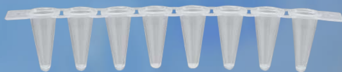
LOW PROFILE (0.1ML) STRIP TUBES