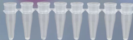
HIGH PROFILE (0.2ML) STRIP TUBES